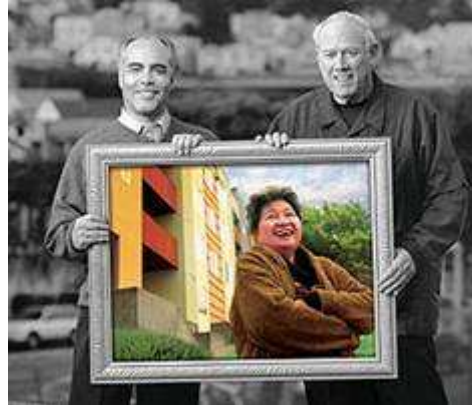
San Francisco Organizing Project

Picture this: In the Outer Mission district of San Francisco, 168 seniors are anxious to know if they'll be among the lucky few chosen for a place at 5199 Mission Street. With affordable housing at a crisis in this city, many seniors living on fixed incomes are barely able to make ends meet. Low-income seniors live in unheated garages or basements, or have to make painful choices between food, medicine, and rent. More than 1600 seniors applied for these 36 apartments.